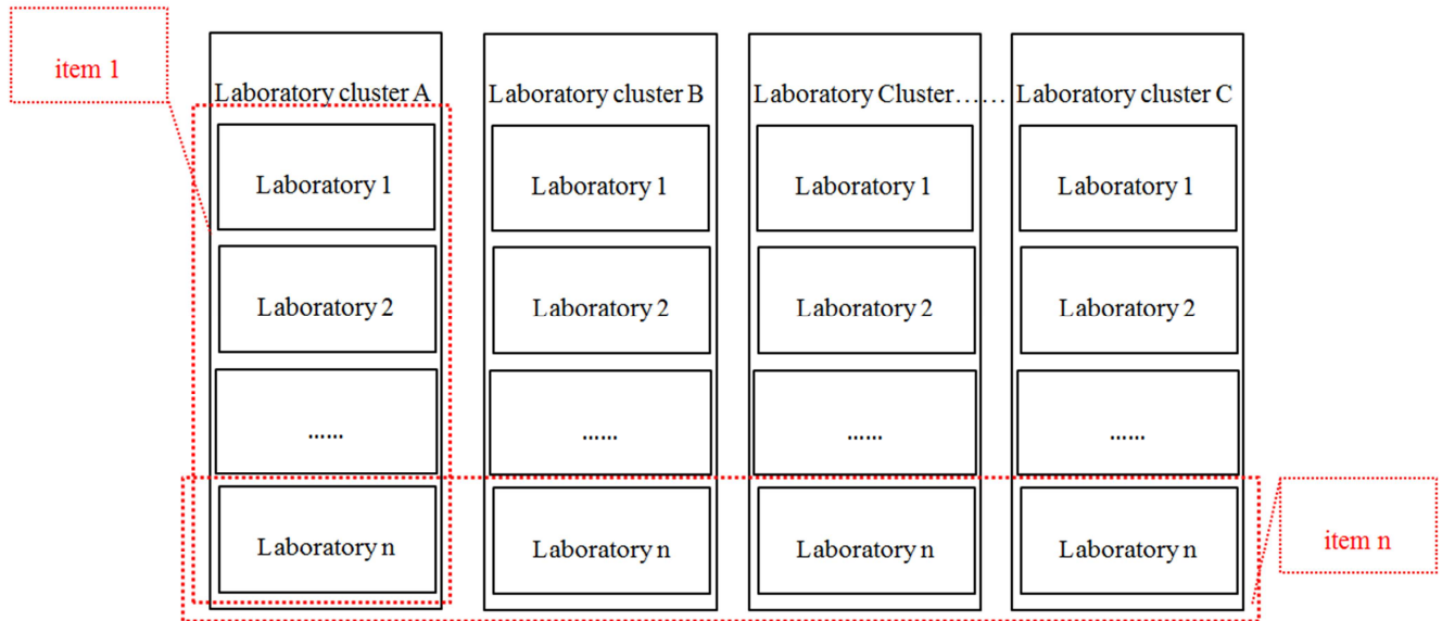
Figure 2. Laboratory cluster based on reuse.